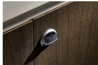
Smart Fingerprint Lock